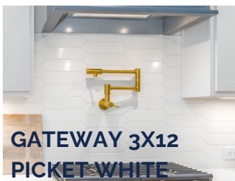
GATEWAY 3X12 PICKET WHITE