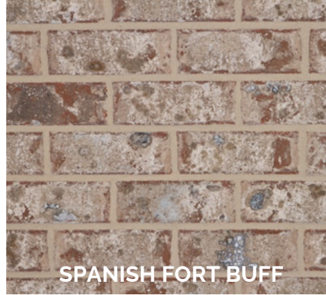
SPANISH FORT BUFF