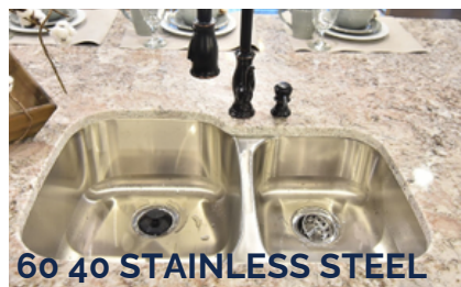
60/40 STAINLESS STEEL