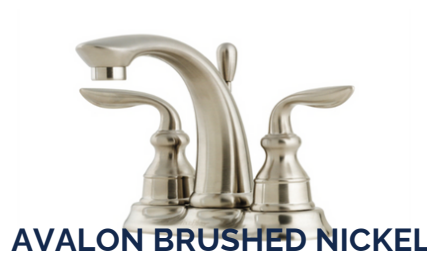
AVALON BRUSHED NICKEL