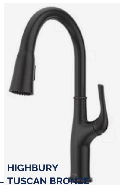
HIGHBURY TUSCAN BRONZE